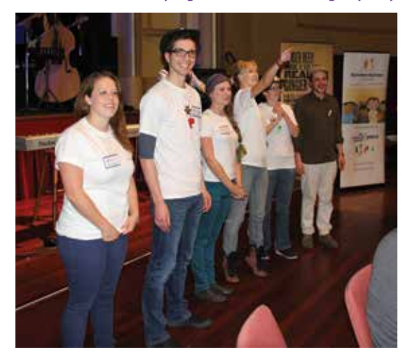
BIG Quiz volunteers – Adelaide